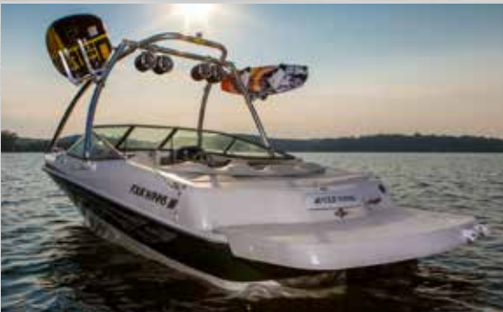
Polished and Anodized MT1 with options

Polished P/N: SOT100 Black finish P/N: SOT101