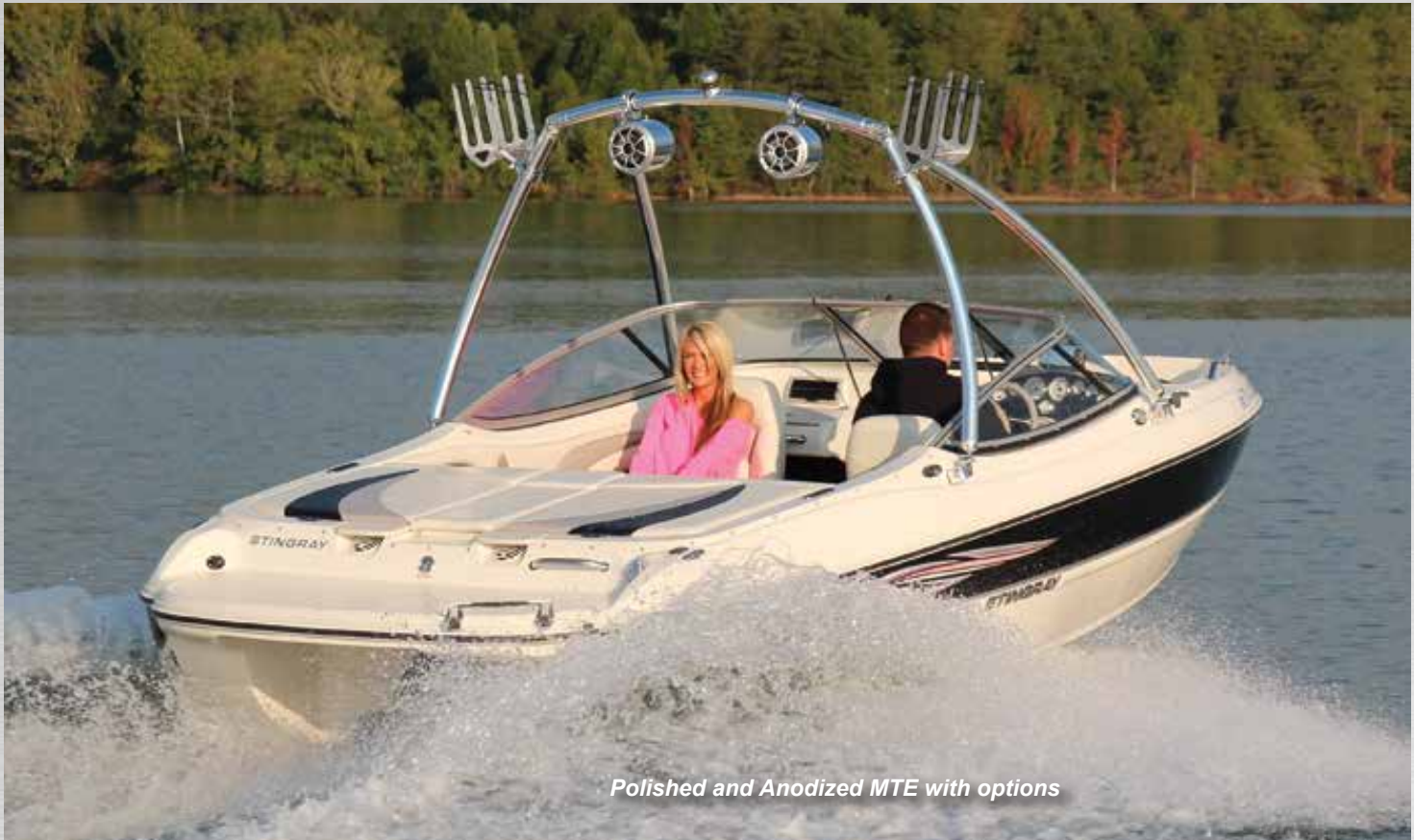
Polished and Anodized MTE with options

The original Monster Tower, the MT1 offers you a choice of polished and anodized aluminum or black powder-coated finish. (Shown with options - not included.)