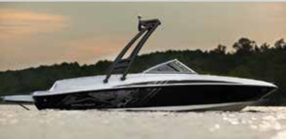
Gloss Black MTK

Polished P/N: SOT405 Black finish P/N: SOT407 White finish P/N: SOT410 Stealth finish P/N: SOT409