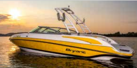
Custom White MTK with options