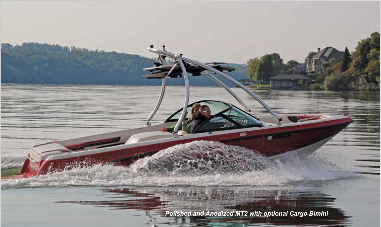
Polished and Anodized MT2 with optional Cargo Bimini