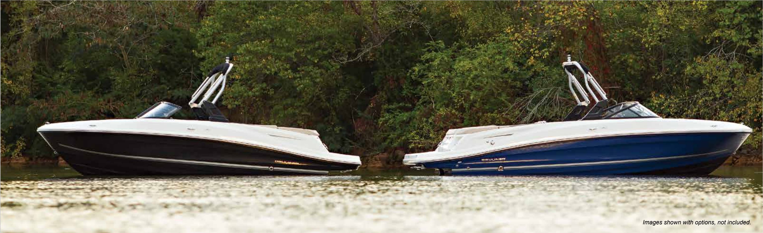
Images shown with options, not included.