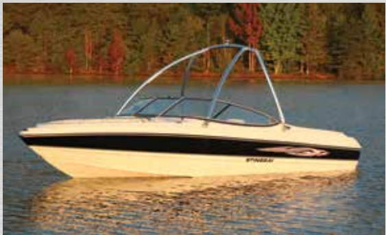
Polished and Anodized MTE

Our most affordable tower, the MTE features sturdy 2.5” diameter polished and anodized aluminum tubing. (Shown with options - not included.)