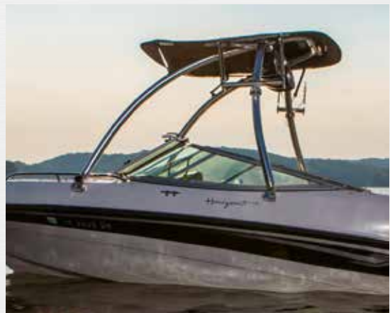
Tower and accessories not included.

P/N: LS-UNI (includes inserts) LS-2.5 (specifically for 2.5" diameter towers)