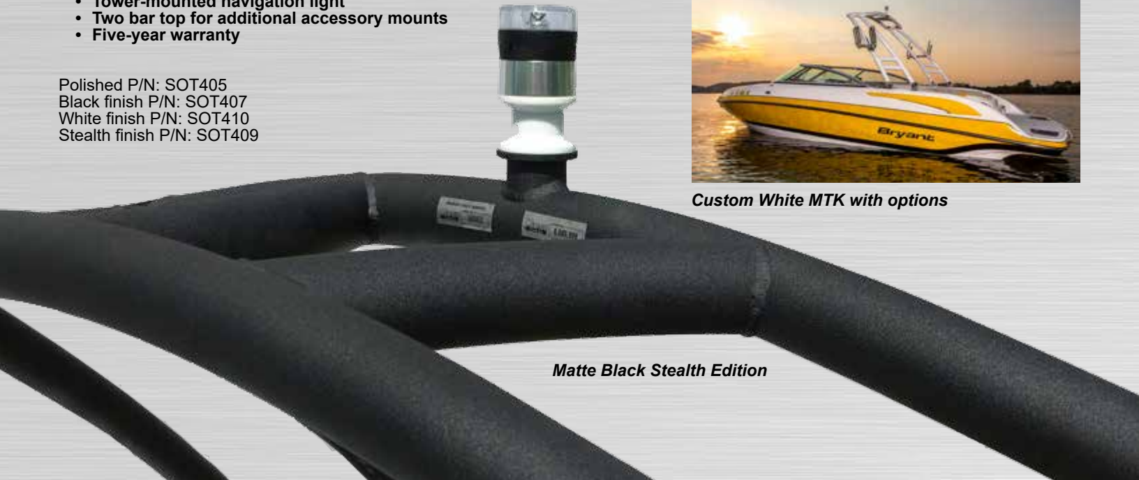
Matte Black Stealth Edition