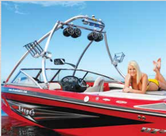
Polished and Anodized MT2 with options