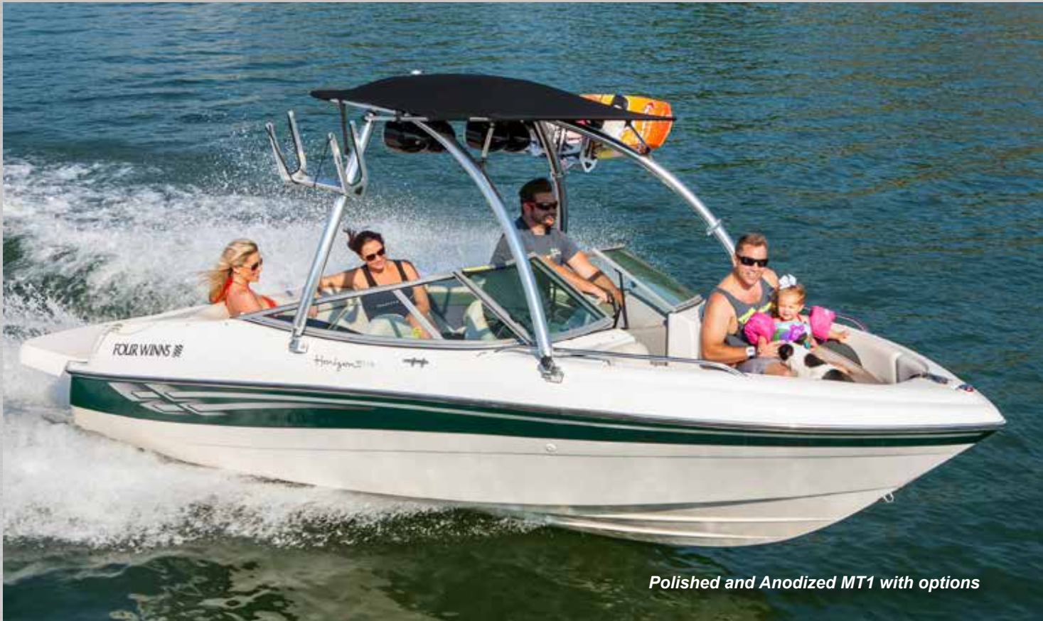
Polished and Anodized MT1 with options