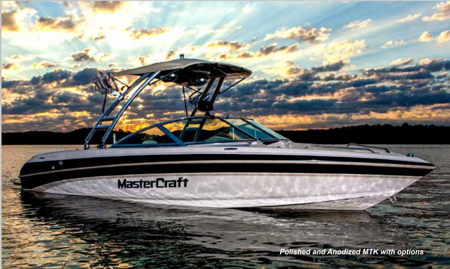
Polished and Anodized MTK with options