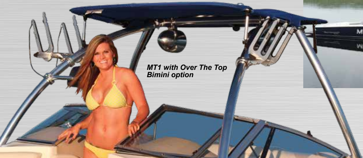
MT1 with Over The Top Bimini option